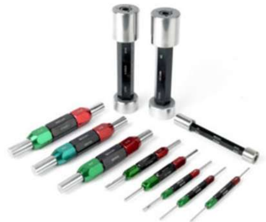
Plain Plug Gauges (Go - No Go)