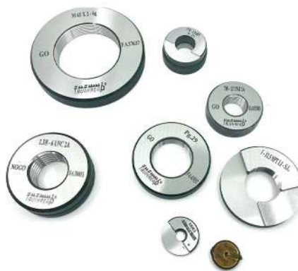
Thread Ring Gauges (Go - No Go)