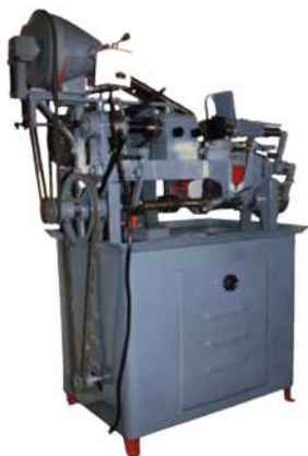
Special Purpose Machine