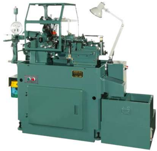
Cam Operated Machine