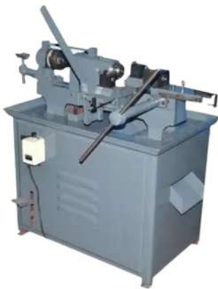
Semi Automatic Turning Machine