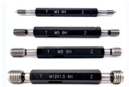
Thread Plug Gauges (Go - No Go)