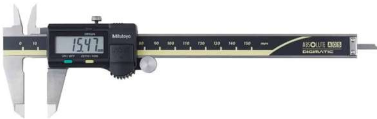
Digital Caliper Vernier