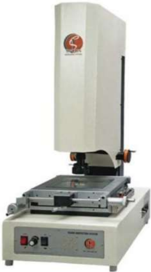
Vision Measuring System