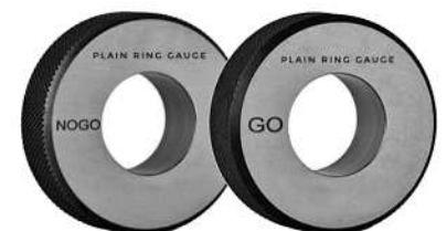
Plain Ring Gauges (Go - No Go)